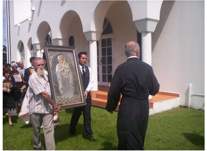
Photo Gallery from 25th March Celebrations